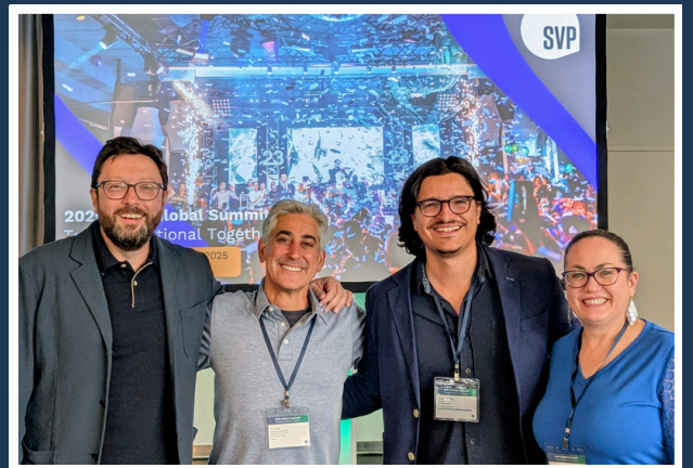
▶ 2025 SVP International Global Summit - Austin, TX