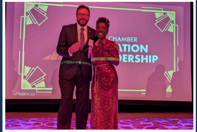
▶ 2025 Celebration of Leadership Boulder Chamber