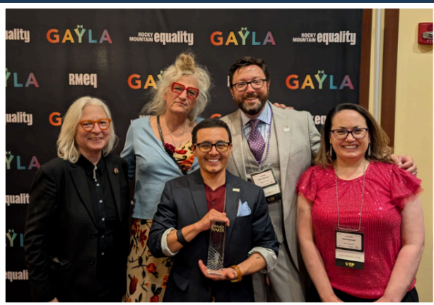
▶ 2025 Corporate Changemaker Award The Gayla, Rocky Mountain Equality