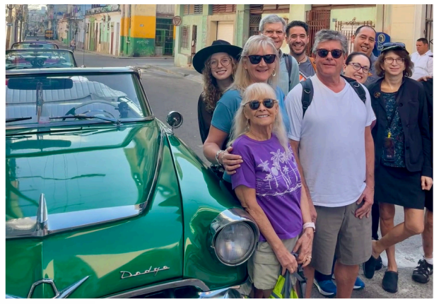
▶ SVP Partners traveled to Cuba with Vive Más Tours