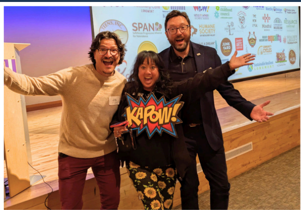
▶ 2025 Celebrating Nonprofits - congrats to Cultivate for winning a grant!