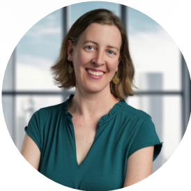
Lark Rambo Chair