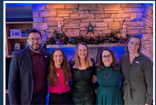
▶ 25 th Anniversary Holiday Party - celebrating 25 years of impact!